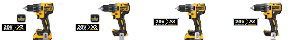
20V Max* XR® Tool Connect™ Compact Drill/Driver Kit 20V Max* XR® Tool Connect™ Compact Drill/Driver (Tool Only) 20V MAX* XR® Brushless Compact Drill/Driver Kit 20V MAX* XR® Brushless Compact Drill/Driver (Tool Only)