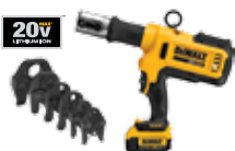
20V MAX* Press Tool Kit