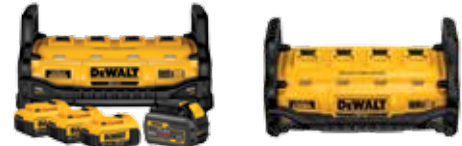
1800 Watt Portable Power Station™ Charger Kit