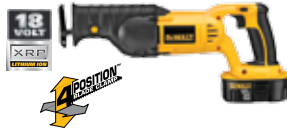
18V XRP™ Reciprocating Saw Kit