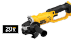
20V MAX* 4-1/2" (114 mm) / 5" (127 mm) Grinder (Tool Only)