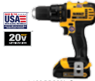
20V MAX* Compact Drill/Driver Kit