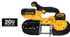
20V MAX* Band Saw