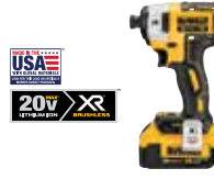
20V MAX* XR® 1/4" 3-Speed Impact Driver Kit