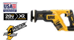
20V MAX* XR ® Compact Reciprocating Saw (Tool Only)