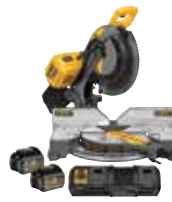
FLEXVOLT ® 120V MAX* 12" Double Bevel Compound Miter Saw Kit