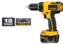
18V Compact 1/2" (13 mm) Drill/Driver Kit