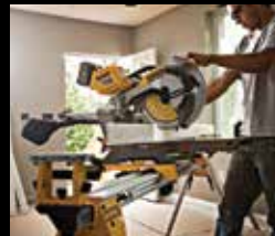
See page 19