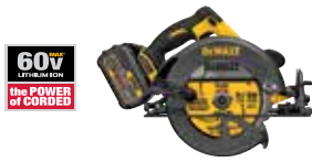
FLEXVOLT® 60V MAX* 7-1/4" (184mm) Circular Saw Kit