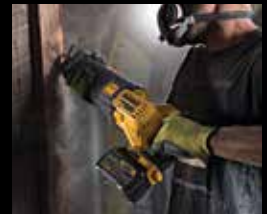
See page 17