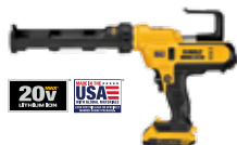
20V MAX* 10oz Adhesive Gun