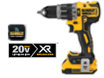
20V MAX* XR® Brushless Tool Connect™ Compact Hammerdrill Kit