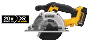
20V MAX* 5-1/2" (127 mm) Metal Cutting Circular Saw Kit