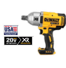
20V MAX* XR ® High Torque 3/4" Impact Wrench with Hog Ring Retention Pin Anvil (Tool Only)