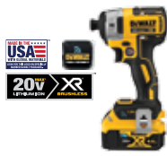
20V MAX* XR® Brushless Tool Connect™ Impact Driver Kit (with Tool Connect™ Batteries)