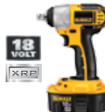
18V XRP™ 1/2" (13 mm) Impact Wrench Kit