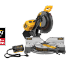
FLEXVOLT ® 120V MAX* 12" Double Bevel Compound Miter Saw