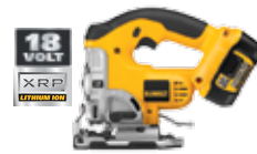
18V XRP™ Jig Saw Kit