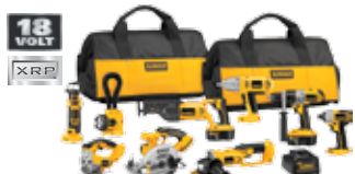
18V XRP™ 9-Tool Combo Kit