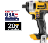
20V MAX* 1/4" (6.35 mm) Impact Driver (Tool Only)