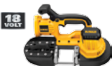
18V Band Saw (Tool Only)