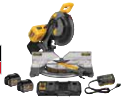
FLEXVOLT ® 120V MAX* 12" Double Bevel Compound Miter Saw Kit