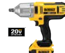
20V MAX* 1/2" (13 mm) Impact Wrench Kit with Detent Pin Anvil