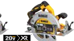
20V MAX* 7-1/4" (184mm) Circular Saw