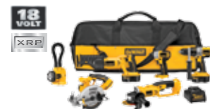
18V XRP™ 6-Tool Combo Kit