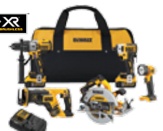
20V MAX* XR ® 5-Tool Combo Kit