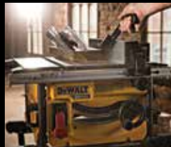
See page 19