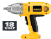
18V 1/2" (13 mm) High Torque Impact Wrench with Detent Pin Anvil (Tool Only)