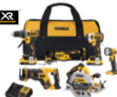
20V MAX* XR ® 6-Tool Combo Kit