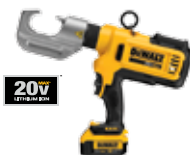
20V MAX* Died Electrical Cable Crimping Tool