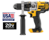
20V MAX* 3-Speed Hammerdrill (Tool Only)