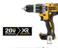
20V MAX* XR® Brushless Compact Hammerdrill (Tool Only)