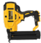
20V MAX* XR® Brushless 18 Gauge Brad Nailer (Tool Only)