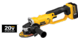
20V MAX* 4-1/2" (114 mm) / 5" (127 mm) Grinder Kit