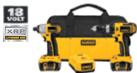
18V XRP™ 2-Tool Combo Kit