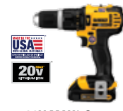
20V MAX* Compact Hammerdrill Kit