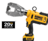
20V MAX* Dieless Cable Crimping Tool