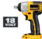
18V 1/2" (13 mm) Impact Wrench (Tool Only)