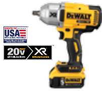
20V MAX* XR ® High Torque 1/2" Impact Wrench with Hog Ring Anvil Kit