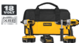
18V XRP™ 2-Tool Combo Kit