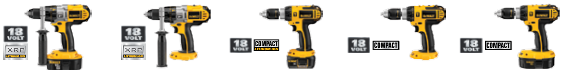
18V XRP™ 1/2" (13 mm) Hammerdrill/Drill/Driver Kit 18V XRP™ 1/2" (13 mm) Hammerdrill/Drill/Driver (Tool Only) 18V Compact 1/2" (13 mm) Hammerdrill Kit 18V Compact 1/2" (13 mm) Hammerdrill (Tool Only) 18V Compact 1/2" (13 mm) Hammerdrill Kit