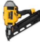
20V MAX* XR® Brushless Framing Nailer (Tool Only)