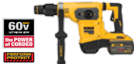
FLEXVOLT ® 60V MAX* 1-9/16\"/>