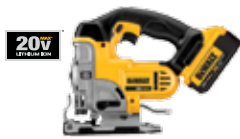
20V MAX* Jig Saw Kit