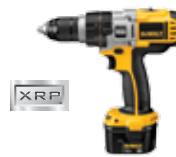
12V XRP™ 1/2" (13 mm) Drill/Driver Kit