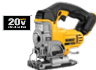
20V MAX* Jig Saw (Tool Only)