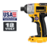
18V 1/4" (6.35 mm) Impact Driver (Tool Only)