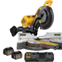
FLEXVOLT ® 120V MAX* 12" Double Bevel Compound Sliding Miter Saw Kit