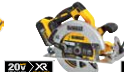
20V MAX* 7-1/4" (184mm) Circular Saw Kit