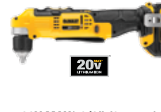
20V MAX* 3/8" (9.5 mm) Right Angle Drill/Driver Kit