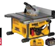
FLEXVOLT ® 60V MAX* 8-1/4" Table Saw Kit