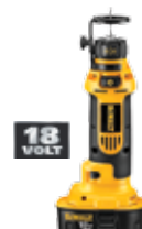
18V Cut-Out Tool Kit