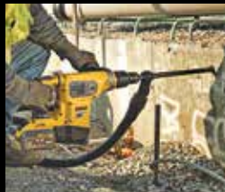
See page 15