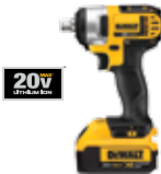
20V MAX* 1/2" (13 mm) Impact Wrench Kit with Detent Pin