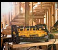
See page 32