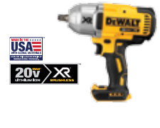
20V MAX* XR ® High Torque 1/2" Impact Wrench with Detent Pin Anvil (Tool Only)