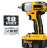
18V XRP™ 3/8" (9.5 mm) Impact Wrench Kit