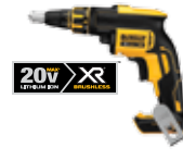
20V MAX* XR® Drywall Screwgun