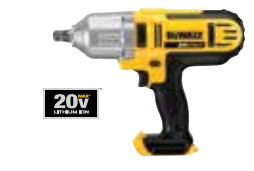
20V MAX* 1/2" (13 mm) Impact Wrench with Detent Pin Anvil (Tool Only)