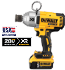
20V MAX* XR ® High Torque 7/16" Impact Wrench with Quick Release Chuck Kit