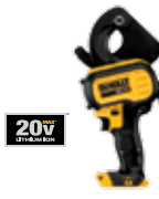
20V MAX* Cable Cutting Tool (Tool Only)