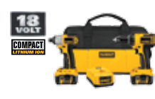
18V Compact 2-Tool Combo Kit