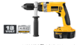
18V XRP™ 1/2" (13 mm) Hammerdrill/Drill/Driver Kit