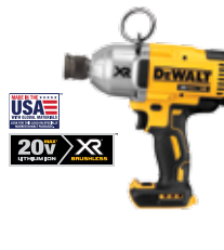
20V MAX* XR ® High Torque 7/16" Impact Wrench with Quick Release Chuck (Tool Only)