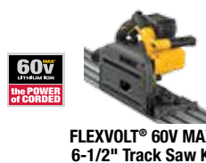
FLEXVOLT® 60V MAX* 6-1/2" Track Saw Kit