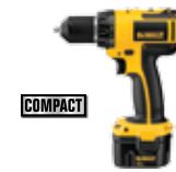
12V Compact 3/8" (10 mm) Drill/Driver Kit