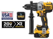
20V MAX* XR® Tool Connect™ 3-Speed Hammerdrill Kit (with Tool Connect™ Batteries)