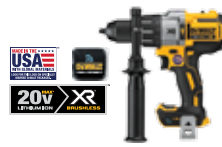
20V MAX* XR® Tool Connect™ 3-Speed Hammerdrill (Tool Only)