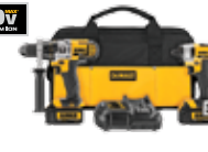
20V MAX* 2-Tool Combo Kit