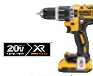
20V MAX* XR® Brushless Compact Hammerdrill Kit