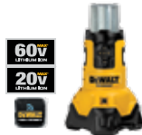
20V MAX* Tool Connect™ Corded/Cordless LED Area Light Kit