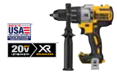
20V MAX* XR® Brushless 3-Speed Hammerdrill Kit (Tool Only)