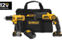
12V MAX* 2-Tool Combo Kit