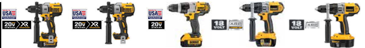
20V MAX* XR® 3-Speed Drill/Driver Kit 20V MAX* XR® 3-Speed Drill/Driver Kit 20V MAX* 3-Speed Drill/Driver Kit 18V XRP™ 1/2" (13 mm) Drill/Driver Kit 18V XRP™ 1/2" (13 mm) Drill/Driver Kit