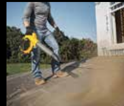
See page 68