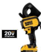
20V MAX* Cable Cutting Tool Kit