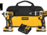
20V MAX* XR® 2-Tool Combo Kit