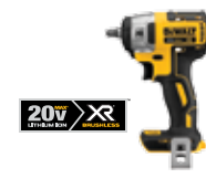
20V MAX* XR ® Brushless 3/8" Compact Impact Wrench (Tool Only)