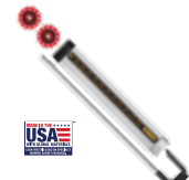
600mL Clear Sausage Tube Conversion Kit