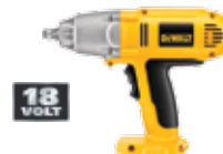
18V 1/2" (13 mm) High Torque Impact Wrench with Hog Ring Anvil (Tool Only)