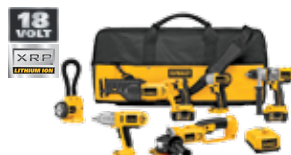
18V XRP™ 6-Tool Combo Kit