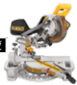
20V MAX* 7 1/4" Sliding Miter Saw Kit