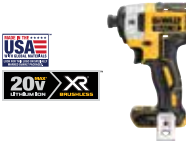
20V MAX* XR® 1/4" 3-Speed Impact Driver Kit (Tool Only)