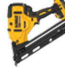
20V MAX* XR® Brushless 15 Gauge Angled Finish Nailer Kit