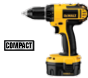
14.4V Compact 1/2" (13 mm) Drill/Driver Kit