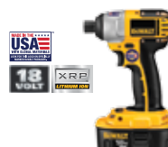
18V XRP™ 1/4" (6.35 mm) Impact Driver Kit