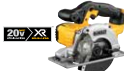
20V MAX* 5-1/2" (127 mm) Metal Cutting Circular Saw (Tool Only)