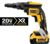
20V MAX* XR® Versa-Clutch™ Adjustable Torque Screwgun Kit