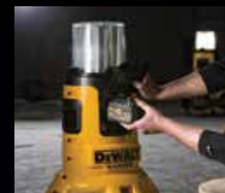
See page 27