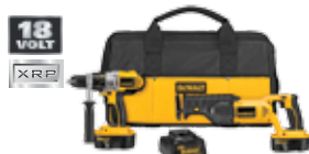
18V XRP™ 2-Tool Combo Kit