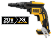
20V MAX* XR® Versa-Clutch™ Adjustable Torque Screwgun