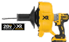
20V MAX* XR® Brushless Drain Snake Kit