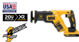
20V MAX* XR ® Compact Reciprocating Saw Kit