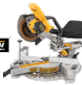
20V MAX* 7 1/4" Sliding Miter Saw