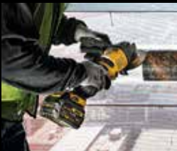
See page 25