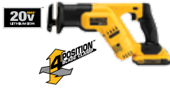
20V MAX* Compact Reciprocating Saw Kit