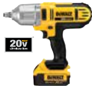
20V MAX* 1/2" (13 mm) Impact Wrench Kit with Hog Ring Anvil