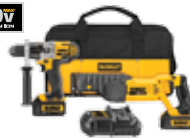
20V MAX* 2-Tool Combo Kit