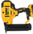
20V MAX* XR® Brushless 18 Gauge Brad Nailer Kit