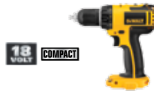
18V Compact 1/2" (13 mm) Drill/Driver (Tool Only)