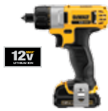
12V MAX* 1/4" (6.35 mm) Screwdriver Kit