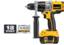
18V XRP™ 1/2" (13 mm) Hammerdrill/Drill/Driver Kit