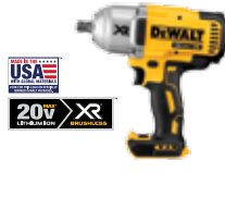
20V MAX* XR ® High Torque 1/2" Impact Wrench with Hog Ring Anvil (Tool Only)