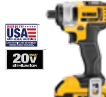
20V MAX* 1/4" (6.35 mm) Impact Driver Kit