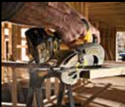
See page 16