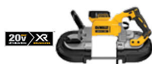
20V MAX* XR® Brushless Deep Cut Band Saw Kit