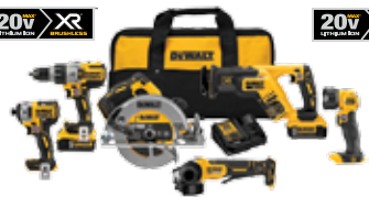
20V MAX* XR ® 6-Tool Combo Kit