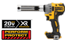
20V MAX* XR® Cable Stripper (THHN/XHHW) (Tool Only)