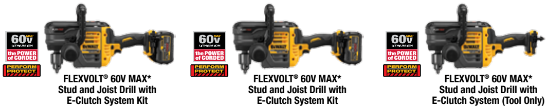
FLEXVOLT® 60V MAX* Stud and Joist Drill with E-Clutch System Kit