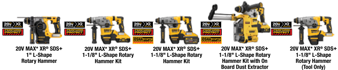
20V MAX* XR® SDS+ 1" L-Shape Rotary Hammer