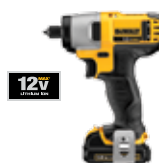
12V MAX* 1/4" (6.35 mm) Impact Driver Kit