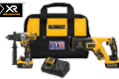
20V MAX* XR ® Hammerdrill and Reciprocating Saw Kit