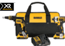
20V MAX* XR ® Drywall Screwgun and Impact Driver Kit