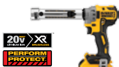
20V MAX* XR® Cable Stripper Kit (THHN/XHHW)