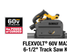
FLEXVOLT® 60V MAX* 6-1/2" Track Saw Kit