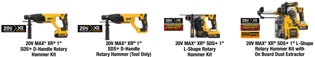
20V MAX* XR® 1" SDS+ D-Handle Rotary Hammer Kit