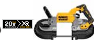
20V MAX* XR® Brushless Deep Cut Band Saw (Tool Only)