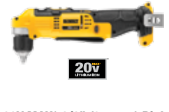
20V MAX* 3/8" (9.5 mm) Right Angle Drill/Driver (Tool Only)