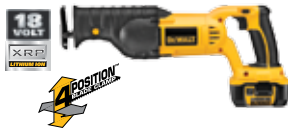
18V XRP™ Reciprocating Saw Kit