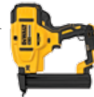
20V MAX* XR® Brushless 18 Gauge Narrow Crown Stapler (Tool Only)