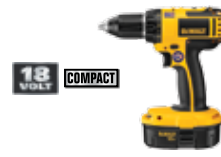
18V Compact 1/2" (13 mm) Drill/Driver Kit