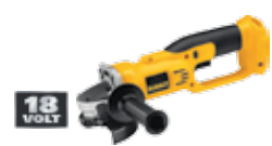
18V Cut-Off Tool (Tool Only)