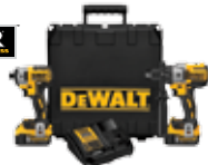
20V MAX* XR® 2-Tool Combo Kit