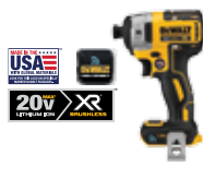
20V MAX* XR® Brushless Tool Connect™ Impact Driver (Tool Only)