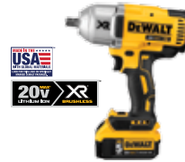
20V MAX* XR ® High Torque 1/2" Impact Wrench with Detent Pin Anvil Kit