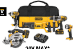
20V MAX* 5-Tool Combo Kit