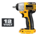
18V 3/8" (9.5 mm) High Torque Impact Wrench (Tool Only)