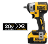
20V MAX* XR ® Brushless 3/8" Compact Impact Wrench Kit