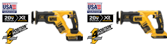
20V MAX* XR ® Compact Reciprocating Saw Kit