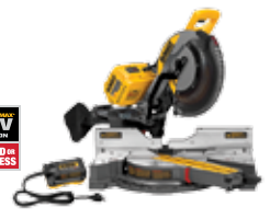
FLEXVOLT ® 120V MAX* 12" Double Bevel Compound Sliding Miter Saw