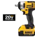
20V MAX* 1/2" (13 mm) Impact Wrench Kit with Hog Ring Anvil