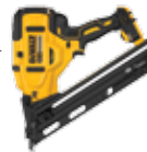
20V MAX* XR® Brushless 15 Gauge Angled Finish Nailer (Tool Only)