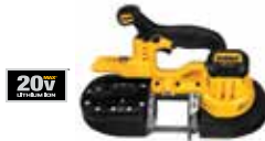
20V MAX* Band Saw (Tool Only)