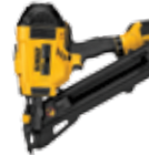
20V MAX* XR® Brushless Metal Connector Nailer Kit