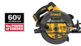
FLEXVOLT® 60V MAX* 7-1/4" (184mm) Circular Saw Kit (Tool Only)