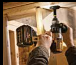
See page 29