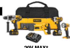
20V MAX* 4-Tool Combo Kit