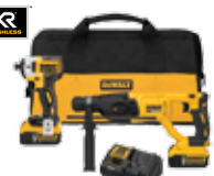
20V MAX* XR ® Rotary Hammer and Impact Driver Kit