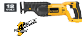
18V Reciprocating Saw (Tool Only)