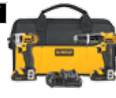
20V MAX* 2-Tool Combo Kit