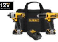
12V MAX* Drill/Driver / Impact Driver Combo Kit