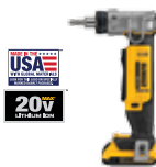
1" Pex Expander Tool Kit