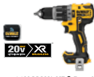
20V MAX* XR® Brushless Tool Connect™ Compact Hammerdrill (Tool Only)