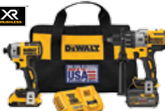
20V MAX* XR ® Hammerdrill and Impact Driver Kit