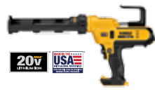
20V MAX* 10oz Adhesive Gun (Tool Only)