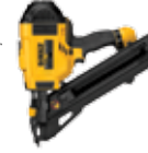
20V MAX* XR® Brushless Metal Connector Nailer (Tool Only)