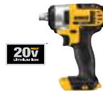
20V MAX* 1/2" (13 mm) Impact Wrench with Detent Pin (Tool Only)