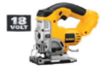
18V Jig Saw (Tool Only)