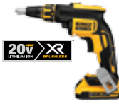
20V MAX* XR® Drywall Screwgun Kit