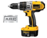
14.4V XRP™ 1/2" (13 mm) Drill/Driver Kit