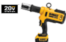
20V MAX* Press Tool Kit