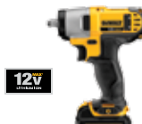
12V MAX* 3/8" (9.5 mm) Impact Wrench Kit