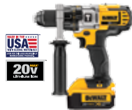
20V MAX* 3-Speed Hammerdrill Kit