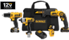
12V MAX* 4-Tool Combo Kit