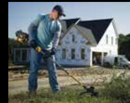
See page 68