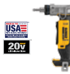
1" Pex Expander (Tool Only)