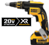
20V MAX* XR® Drywall Screwgun Kit