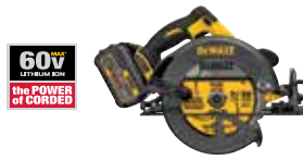
FLEXVOLT® 60V MAX* 7-1/4" (184mm) Circular Saw Kit