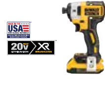
20V MAX* XR® 1/4" 3-Speed Impact Driver (Tool Only)