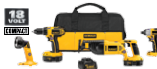
18V Compact 4-Tool Combo Kit