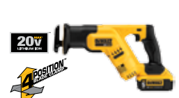
20V MAX* Compact Reciprocating Saw Kit