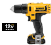
12V MAX* 3/8" (10 mm) Drill/Driver Kit