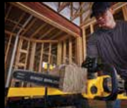
See page 69