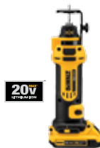
20V MAX* Cut-Out Tool Kit