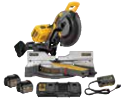
FLEXVOLT ® 120V MAX* 12" Double Bevel Compound Sliding Miter Saw Kit