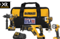
20V MAX* XR ® 4-Tool Combo Kit