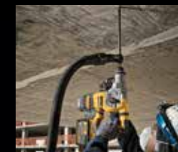
See page 14