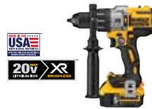
20V MAX* XR® Brushless 3-Speed Hammerdrill Kit