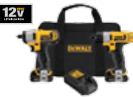
12V MAX* Screwdriver / Impact Driver Combo Kit