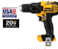
20V MAX* Compact Drill/Driver (Tool Only)