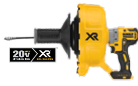
20V MAX* XR® Brushless Drain Snake (Tool Only)