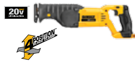
20V MAX* Reciprocating Saw (Tool Only)