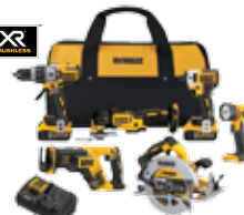
20V MAX* XR ® 6-Tool Combo Kit