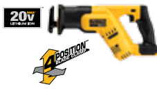
20V MAX* Compact Reciprocating Saw (Tool Only)