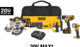
20V MAX* 4-Tool Combo Kit