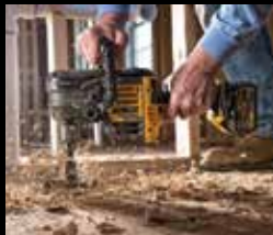
See page 14