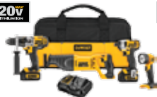
20V MAX* 4-Tool Combo Kit