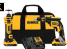
20V MAX* XR ® Drywall Screwgun and Cut-Out Tool Kit