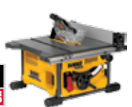
FLEXVOLT ® 60V MAX* 8-1/4" Table Saw