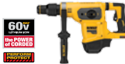
FLEXVOLT ® 60V MAX* 1-9/16\"/>