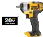
20V MAX* 3/8" (9.5 mm) Impact Wrench with Hog Ring (Tool Only)