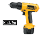
9.6V Compact 3/8" (10 mm) Drill/Driver Kit