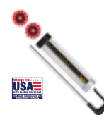
465mL Clear Sausage Tube Conversion Kit