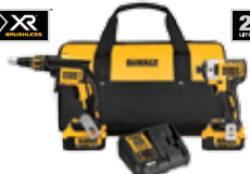
20V MAX* XR ® Drywall Screwgun and Impact Driver Kit