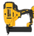
20V MAX* XR® Brushless 18 Gauge Narrow Crown Stapler Kit