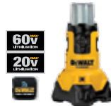
20V MAX* Tool Connect™ Corded/Cordless LED Area Light