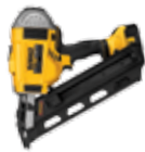
20V MAX* XR® Brushless Framing Nailer Kit