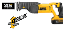
20V MAX* Reciprocating Saw Kit