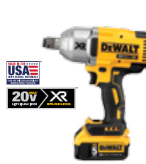
20V MAX* XR ® High Torque 3/4" Impact Wrench with Hog Ring Retention Pin Anvil Kit