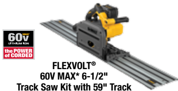
FLEXVOLT® 60V MAX* 6-1/2" Track Saw Kit with 59" Track