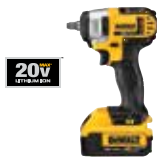
20V MAX* 3/8" (9.5 mm) Impact Wrench with Hog Ring Kit