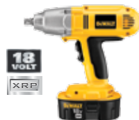
18V XRP™ 1/2" (13 mm) High Torque Impact Wrench Kit with Detent Pin Anvil