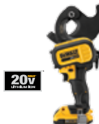
20V MAX* ACSR Cable Cutting Tool Kit