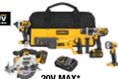
20V MAX* 5-Tool Combo Kit