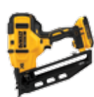
20V MAX* XR® Brushless 16 Gauge Angled Finish Nailer Kit