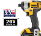
20V MAX* 1/4" (6.35 mm) Impact Driver Kit